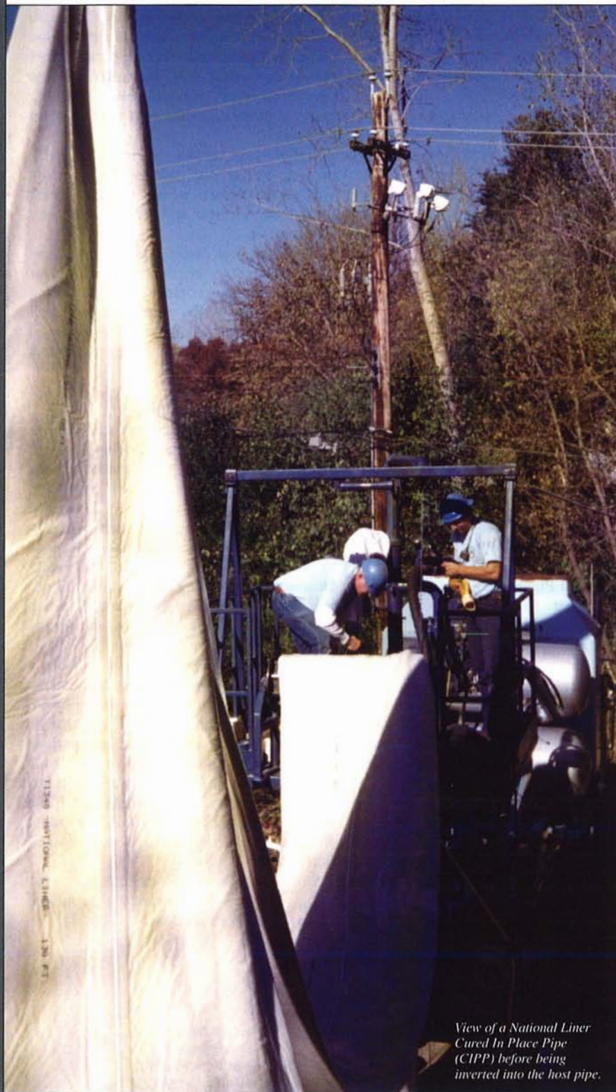
View of a National Liner Cured In Place Pipe (CIPP) before being inverted into the host pipe.

In describing early jobsite activities, Stoffel said that since the first step was to determine the condition of the pipe in place, a televising crew was mobilized to